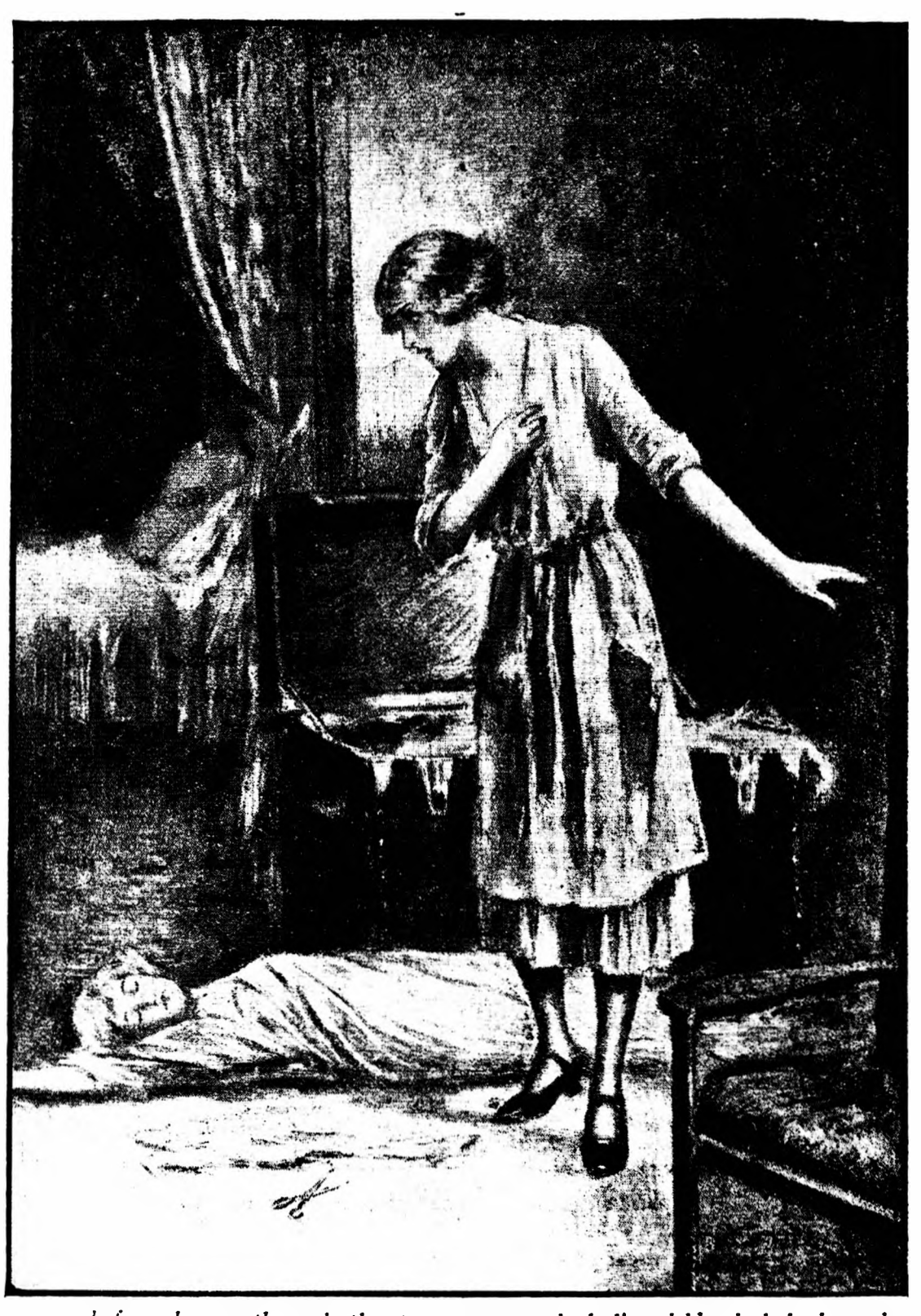
. . . before she was through, the strange woman had clipped blonde hair, instead of her former long tresses. . . . —Page 16